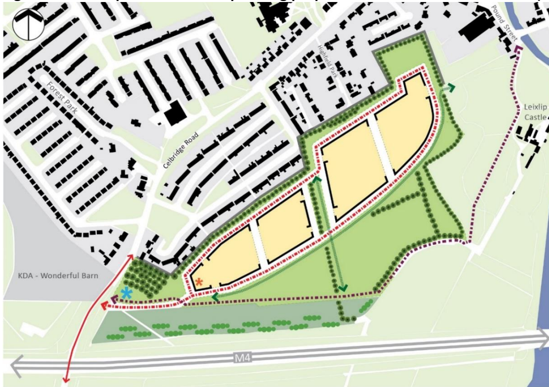
Figure 12-2 Leixlip Gate KDA incorporating proposed Material Alteration No 46 (a)