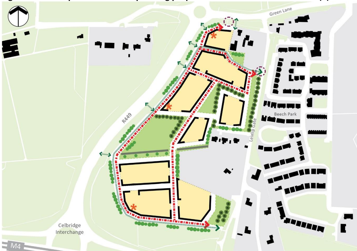
Figure 12-3 Leixlip Gate KDA incorporating proposed Material Alteration No. 47 (a)